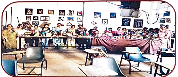
Art & Craft