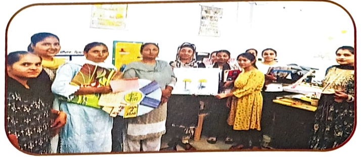
Social Study Lab